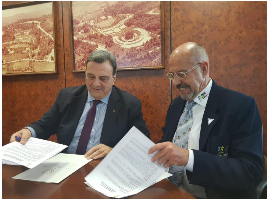
IOA President Isidoros S. Kouvelos and ICG President Torsten Rasch signing the Cooperation Agreement

The ties between International Children's Games (ICG) and the Olympic movement became even stronger with the recent signing of a Cooperation Agreement with the International Olympic Academy (IOA) http://ioa.org.gr . The IOA, based in Athens, Greece, is an institution entrusted by the International Olympic Committee with the preservation and promotion of Olympism through education and social programs – many at its beautiful campus in ancient Olympia. The two organizations will work together to support Olympic-centered educational programs for the world's youth.